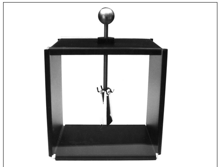
A simple, commercially available leaf electroscope.

The scientific experiments leading to the aether motors and the build-up of a theoretical framework under the rubric “aetherometry” are now beginning to be detailed on the