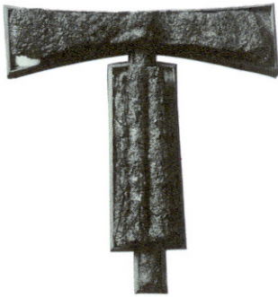
The praetorial fasces, represented as a double ax.

imported from the Greeks. The monarchy ceases being hereditary - and becomes the object of a nomination by the Senate subject to a vote by the Assembly of the People. Likewise, the pressure to remove control of war from the monarchy, and maintain the aristocracy in control of the militia , prevented further militarization of the State.