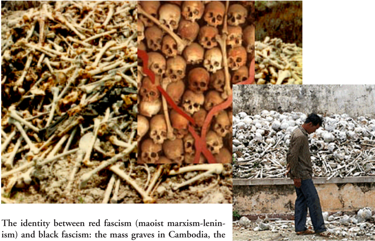
The identity between red fascism (maoist marxism-leninism) and black fascism: the mass graves in Cambodia, the main production of the Khmer Rouge, the legacy of Pol-Pot. Liberation as an act of collective suicide.

ishing either class-struggle or civil strife per se . The world of the technocratic single-class is also the world of the war of all against all , and the war of the world against everyone . Only fascists and leftists promised, in different but parallel ways, that they would achieve the abolition of social warfare. But what they indirectly achieved, or rather, what capitalism achieved despite them, is a single-class society where all social strife is possible, desirable and manageable.